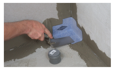
Treat drains, pipe surrounds, corners, wall-to-wall connections and wall-to-floor connections first. Here shown: Inside corner. Apply the thinset to the substrate by using 1/4" x 3/16" V-notched trowel. Press BLANKE AQUA CORN I into the thinset by using the flat side of the trowel, ensuring 100% contact with the substrate. Make sure to press out any air pockets.