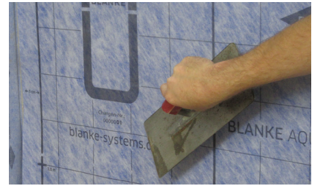
6 Use the flat side of the trowel to ensure 100% contact with the substrate. Make sure to press out any air pockets.