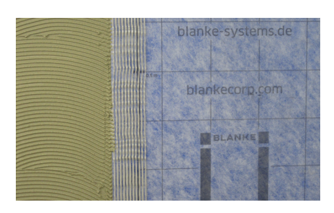
The edges of adjoining BLANKE AQUA SHIELD 100 sections have to overlap by at least 2 inches.