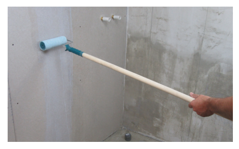
{f 1} The substrate must be clean, flat, dry and load bearing. Priming the substrate is recommended.

Waterproofing membrane for showers, steam rooms and outdoor applications.