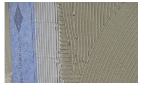
When installing sheets of BLANKE AQUA SHIELD membrane, use thinset on the wall or floor area and BLANKE AQUA SEAL on overlapping seams. Always overlap 2 inches to ensure watertight connections.