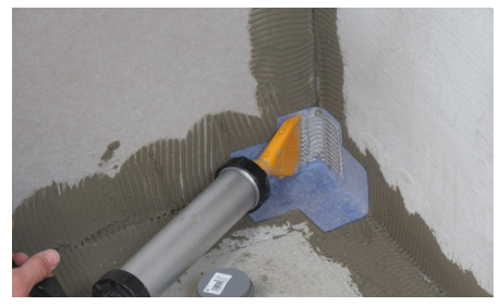
In applications subjected to constant and extremely moist conditions, use BLANKE AQUA SEAL waterproofing adhesive to seal the overlapped seams.