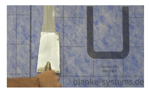
9 Again flatten out any excess BLANKE AQUA SEAL at the seams as shown in step 4.

NOTE: Please note the information in our current technical data sheets when installing. Current installation standards must also be observed.