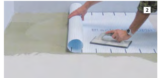
2 APPLY BLANKE SECUMAT TO THE SUBSTRATE AND EMBED MAT WITH FLOAT OR ROLLER.*