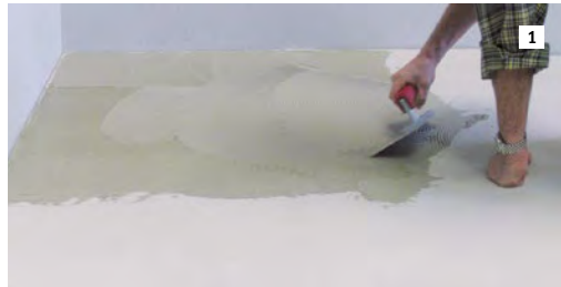
1 APPLY LOOSELY MIXED MODIFIED THINSET MORTAR TO THE SUBSTRATE USING A 3/16" V-NOTCHED TROWEL.

BLANKE SECUMAT is constructed from a fiberglass reinforcing mesh embedded between two layers of polyester fabric.