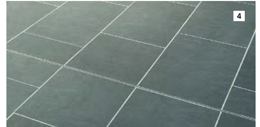
4 REMEMBER TO INSTALL PERIMETER JOINTS AND BLANKE EXPANSION JOINTS PER TCNA GUIDELINES EJ171.**