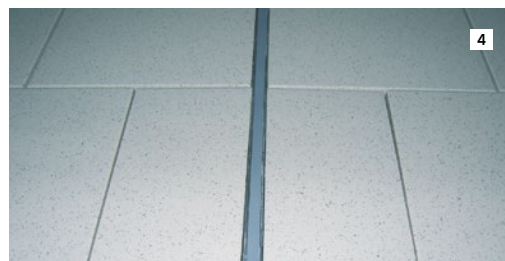
4 REMEMBER TO INSTALL PERIMETER JOINTS AND BLANKE EXPANSION JOINTS PER TCNA GUIDELINES EJ171.**

Competence for installers, building clients and architects The success of BLANKE PERMAT is based on close cooperation with our loyal installers and commercial trading partners, dialogue with planners, architects, and of course, final customers. All of our product partners have tested their products with BLANKE PERMAT and are happy with the results. Information material about the tests and approvals are available on request or by downloading from www.blankecorp.com .