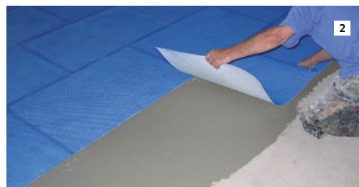
2 INSTALL BLANKE PERMAT FLEECE-SIDE DOWN, MAKING SURE TO OVERLAP AND KEEP 3" MIN. OFFSET PATTERN.*