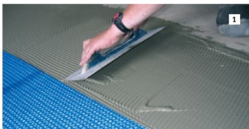
1 APPLY LOOSELY MIXED MODIFIED THINSET TO THE SUBSTRATE USING A 1/4" x 1/4" NOTCHED TROWEL.