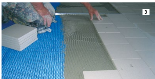
3 WORK THIN-SET MORTAR INTO THE SURFACE OF BLANKE PERMAT, ADD ADDITIONAL MORTAR "FRESH IN FRESH" AND SET TILES.